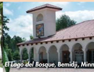
El Lago del Bosque, Bemidji, Minn.