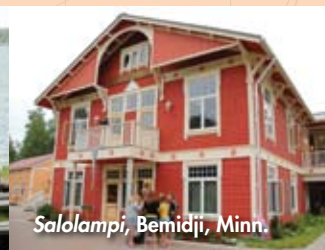
Salolampi, Bemidji, Minn.