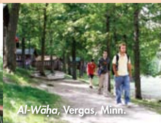
Al-Wāḥa, Vergas, Minn.